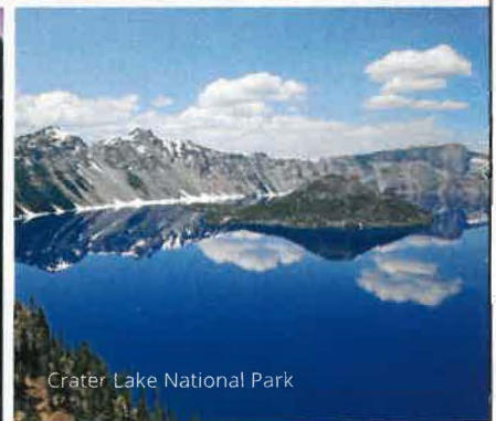
Crater Lake National Park