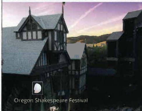
Oregon Shakespeare Festival