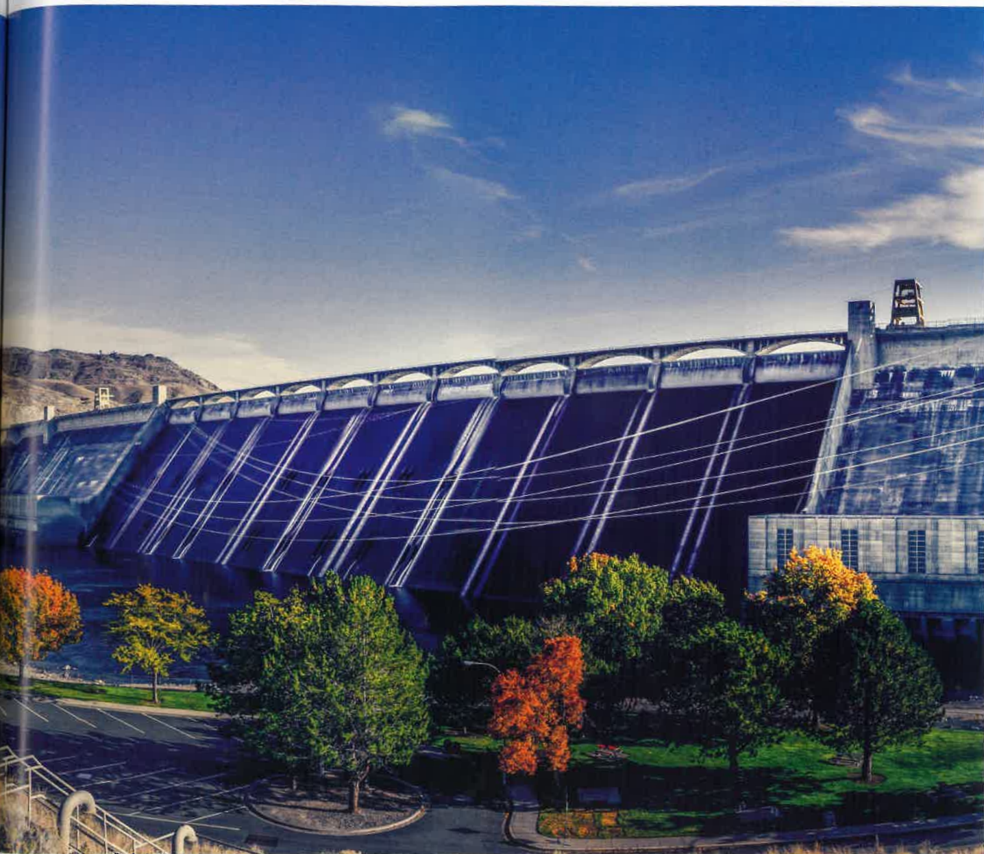
Grand Coulee Dam

Employees often come out and talk tech with guests. Check online before you go; public hours vary. Seattle