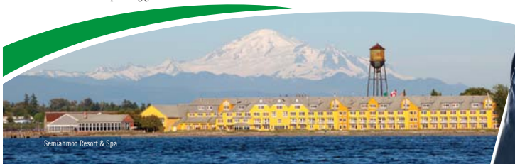
Semiahmoo Resort & Spa