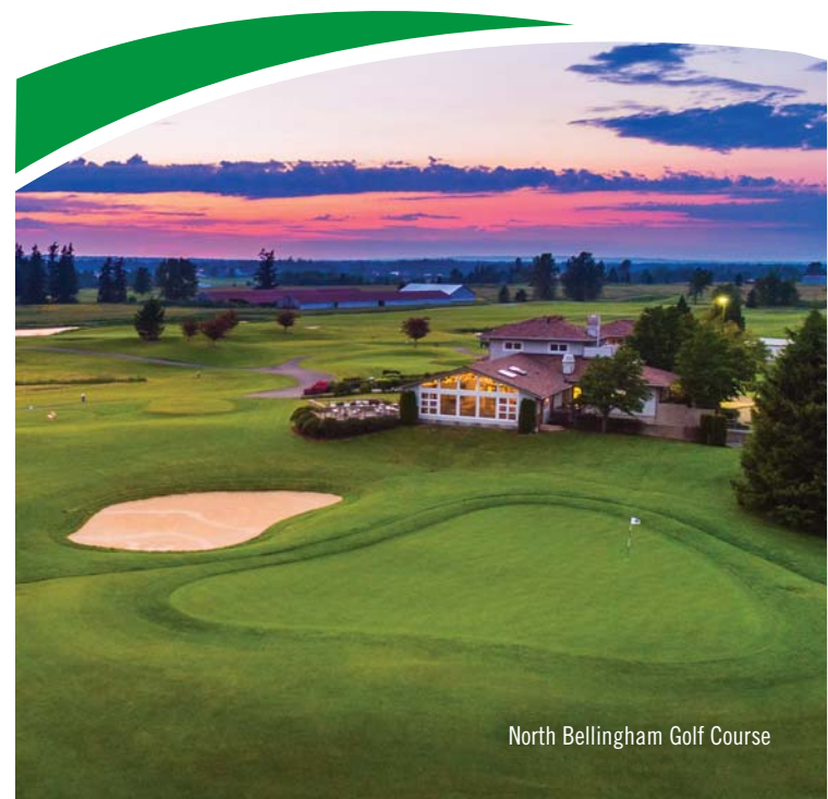
North Bellingham Golf Course

BE IN Bellingham one destination, WHATCOM COUNTY many adventures bellingham.org